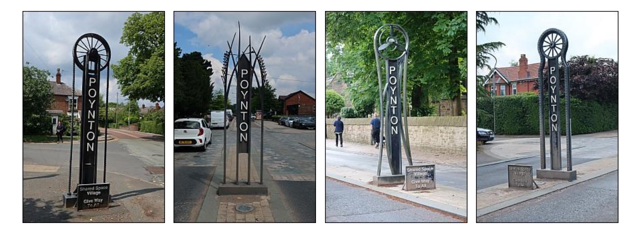
(Click on each picture for a better view of the design)

But each sign shows a different aspect of its history.